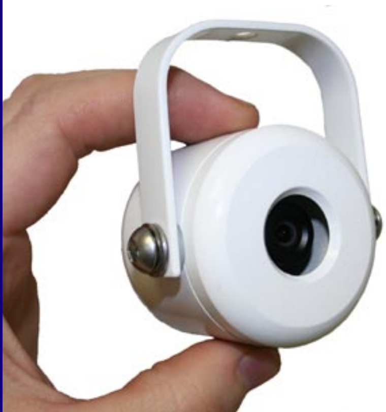
image sensor horizontal resolution sensitivity standard lens power consumption power supply video output operating temperature dimentions